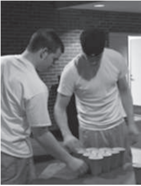
Gatorade Pong was one way to pass time indoors during the recent cold snap.